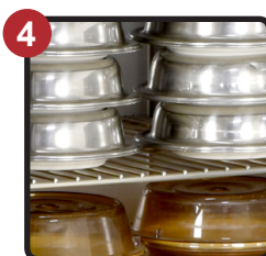
Heavy-Duty "No Sag" Shelves