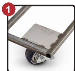
Tubular Welded Base Frame