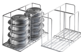
CP carries Covered Plates