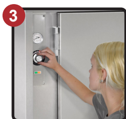
Eye Level Control Panel